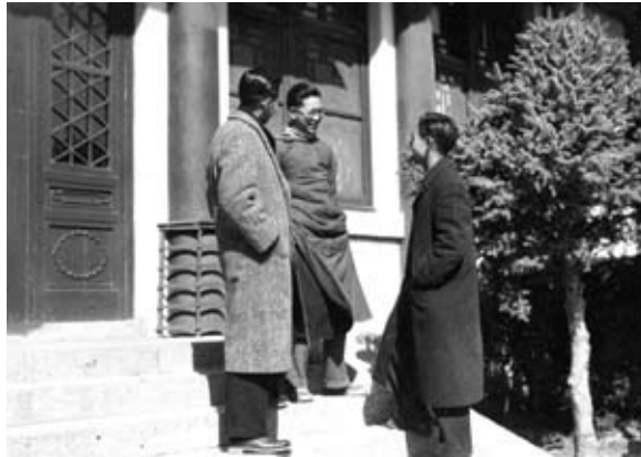
Freshmen on the steps of Miner Hall, Yenching University, 1947

After its first decade of notable success, HYI's cultural engineering in China encountered difficulties during the Second Sino-Japanese War. HYI no longer enjoyed a stable environment in China as it had earlier, and its programs were almost crippled by the extensive military conflicts and attendant rampant inflation. Five of its partner colleges were forced to relocate to southern or southwestern China from the north, east, or southeast of China, with some having to relocate several times. The enormous expenses associated with relocation and the psychological pressures on the administration, faculty, and staff as well as on students were beyond the control of the colleges. Another unfavorable change was the shift of Chinese intellectuals' focus from Chinese cultural studies to national salvation, though some scholars still continued research on cultural-identity construction. Despite the unfavorable context, HYI still kept its regular humanities programs in China going by providing timely and invaluable funding and supervision. HYI also provided generous funding to help its Chinese partner colleges as well as other Christian colleges relocate when their home mission boards encountered financial difficulties during the war years. HYI's efforts helped maintain the morale and spirits of these colleges, and helped to preserve talent and bases for its programs in the postwar era.