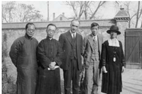
Yenching University Faculty with John Leighton Stuart

Hong Kong, Japan, and South Korea in the early 1950s. Despite the sudden end of its cultural engineering programs in mainland China, HYI has left an important legacy of higher education in the People's Republic of China, especially in the field of the humanities.